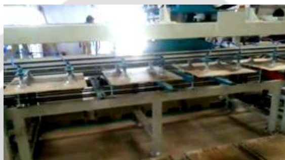
Figure 3: Vacuum gripper to grip tiles

In this research to Automation in tiles unloading is done by using gripper type unloading mechanism and detail drawing and assembly of this mechanism is show in previous chapter. Now in this chapter validate this mechanism by using vacuum type gripper.