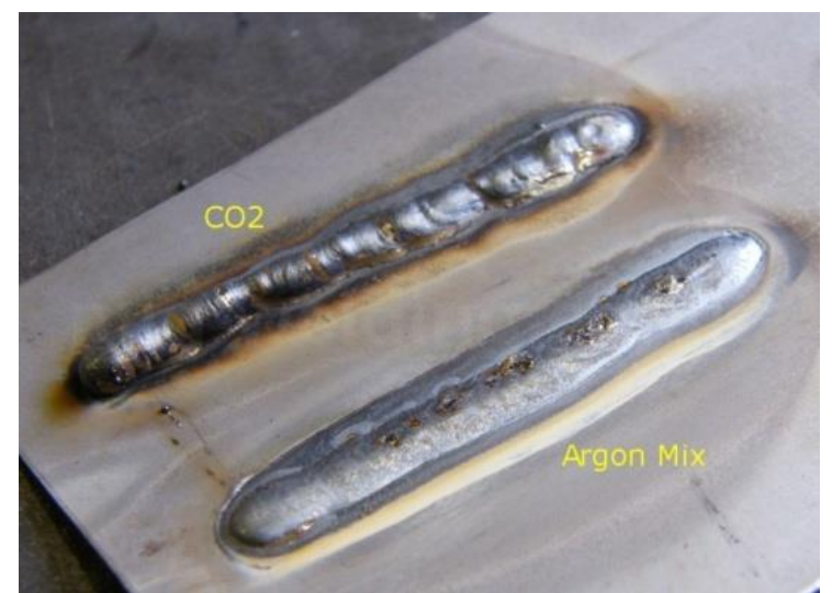
Fig. 2: Part Welded with Argon and Argon + CO_2 Shielding Gas.

Figure 2 shows the difference of work piece welded using argon and combination of Argon-CO_2 shielding gases [4].