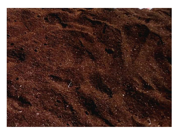
Fig. 1: Finished Biocompost produce from the floral waste