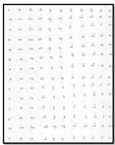
Fig. 2. Barakshari'

In Fig. 4, an example of a handwritten image is given. After the segmentation process, we can get images of the size 28X28 pixels which can be combined characters along with vowel or a single character.